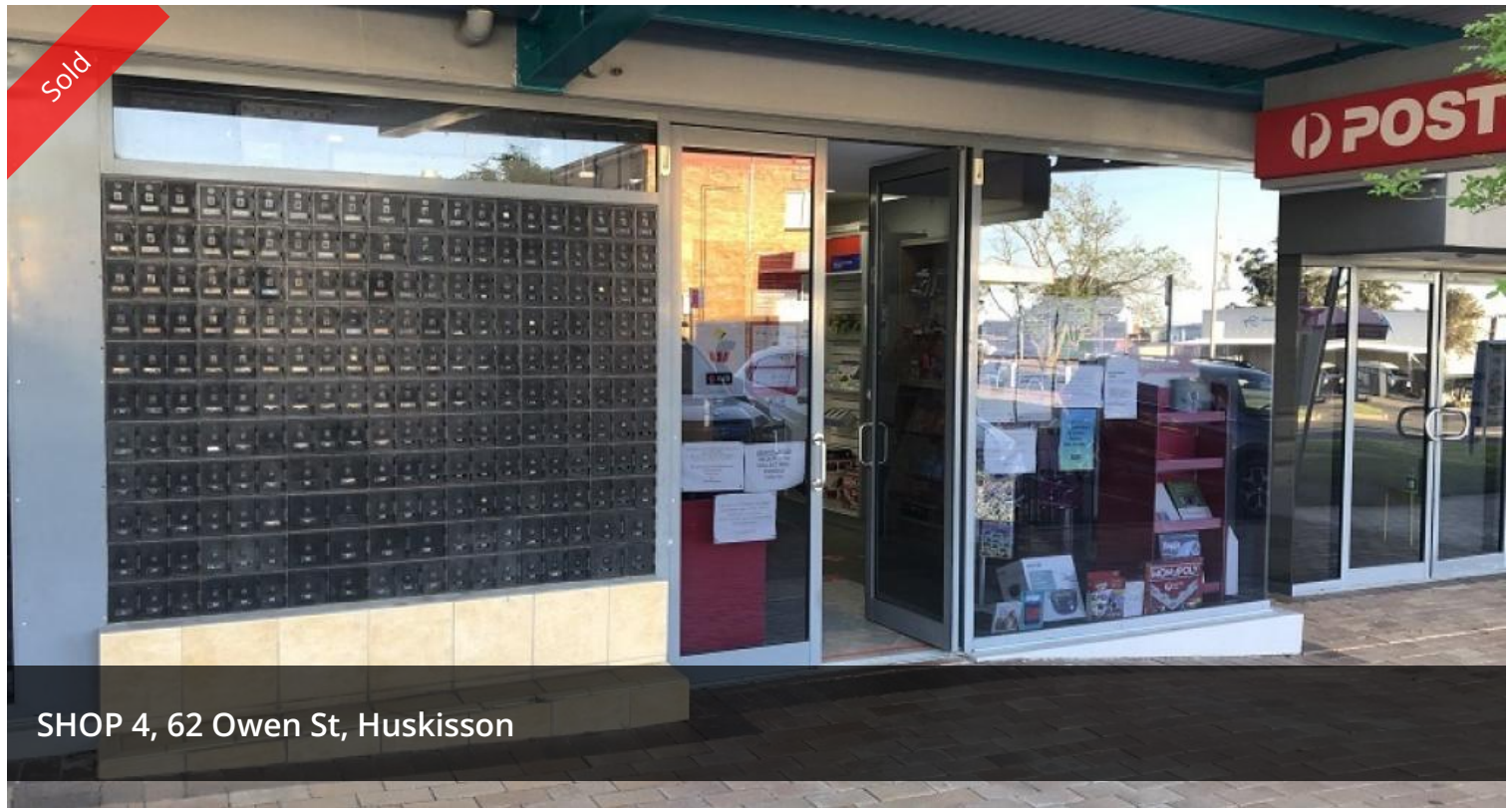
SHOP 4, 62 Owen St, Huskisson